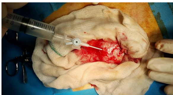
Figure 1. After sealing the operative field with appropriate amounts of Silver nitrate soaked gauze, the cyst punctured and clear fluid aspirated from the cyst

In the operating room, the patient was operated under spinal anesthesia, and classical inguinal incision was preferred, and after going through skin and subcutaneous area, we encountered a large firm hydatid cyst protruding from inguinal canal. After sealing the area with appropriate amounts of gauze, soaked in Silver nitrate the cyst punctured and clear fluid aspirated from the cyst then the cyst was sterilized using Silver nitrate then opened (Figure 1).