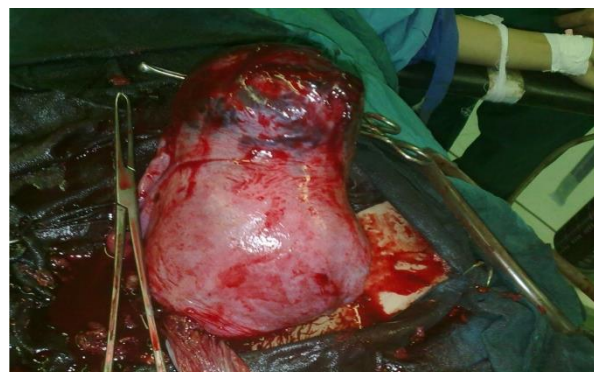
Figure 2. Pregnant uterus with a placenta percreta at fundus

confirmed later by histopathological assessment (Figure 2).