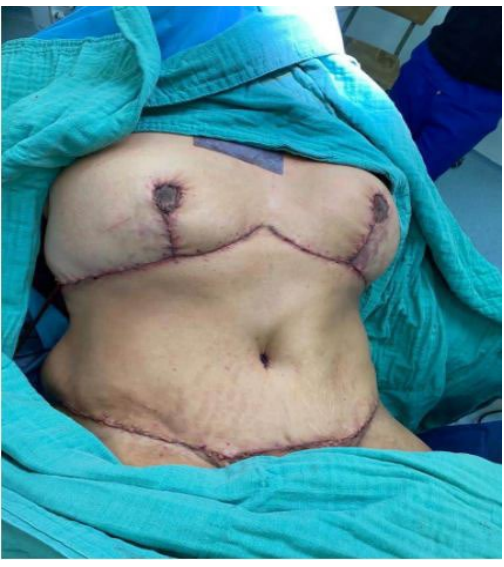
Fig. 2: Immediate postoperative results