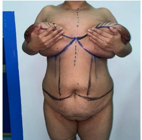
Fig. 1: The Marking of the abdominoplasty and the breast reduction with the superior-internal pedicle technique with Wise's pattern